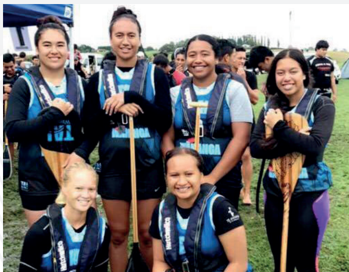
J19 Girls 4th 500m Champ Final 2nd 250m Champ Final